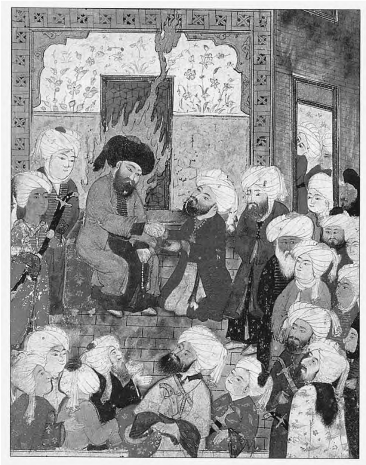
Muslims swearing allegiance to 'Ali, who became the fourth and final "Rightly Guided Caliph" in 656