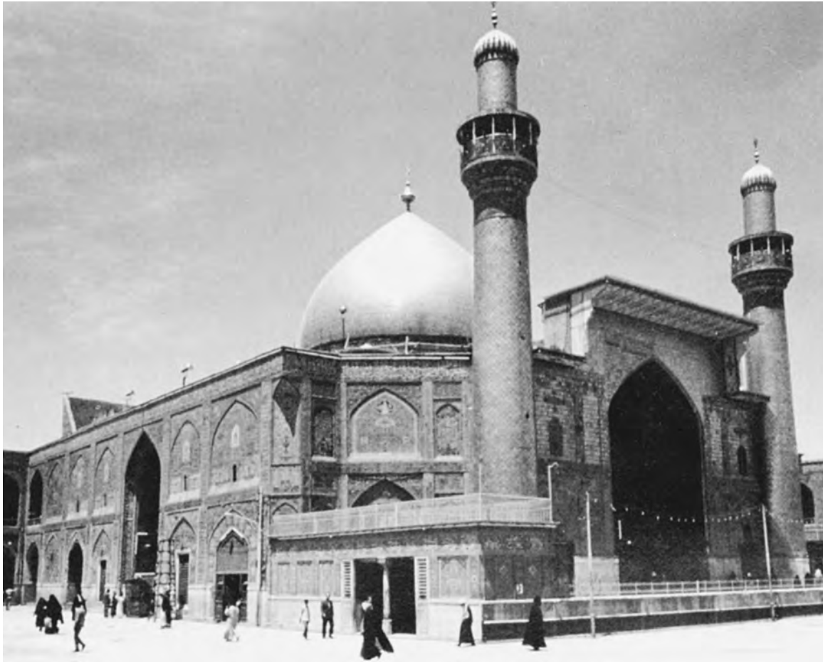
'Ali's burial shrine in Najaf in southern Iraq. The shrine is an important pilgrimage site for Shi'ite Muslims, who believe 'Ali to be the first imam (divinely appointed leader) of the Muslim community ( ; from Albert Hourani, A History of the Arab Peoples (Cambridge, Mass.: Harvard University Press, 1991); Thomas Cooper Library, University of South Carolina).

the imamate of Ja'far al-Sadiq, grew to be famous as a Shi'ite poet praising 'Ali, al-Husayn, and the ahl al-bayt (family of the Prophet). In the tenth and eleventh centuries, al-Sharif al-Radi, the compiler of the Nahj al-balaghah , praised 'Ali extensively in his poetry. In the thirteenth century Ibn Abi al-Hadid (famous for his commentary on the Nahj al-balaghah ), a Mu'tazilite with strong Shi'ite leanings, composed seven odes in praise of 'Ali known as al-Qasa'id al-Sab' al-'Alawiyyat (1256 or 1257; The Seven Odes on 'Ali).